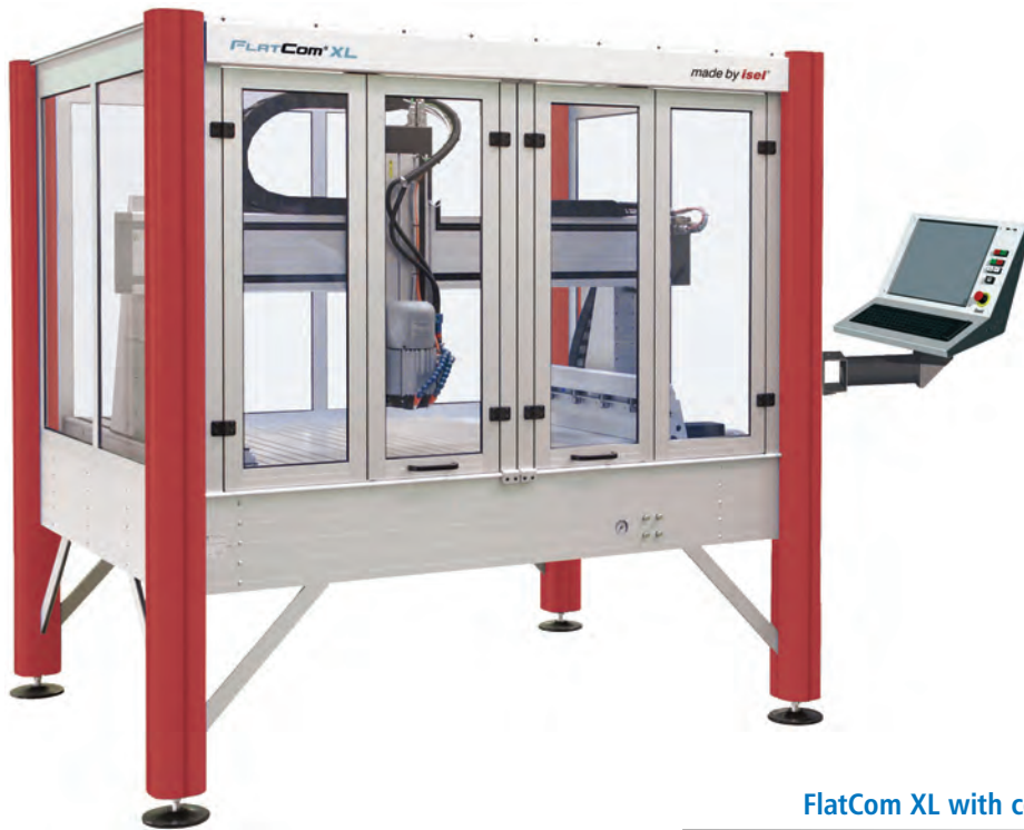
FlatCom XL with control panel

isel ® France Des composants aux Systèmes