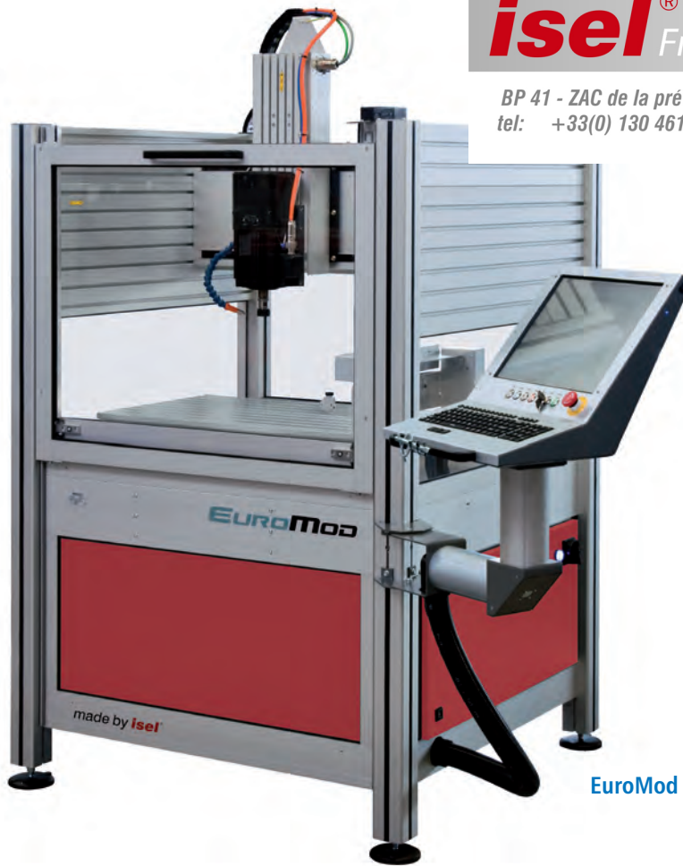
EuroMod MP 30 with closed sliding door

BP 41 - ZAC de la prévôté - 4 rue des côtes d'Orval - F-78550 - HOUDAN tel: +33(0) 130 461 201 fax: +33(0) 130 596 932 email: info@isel.fr